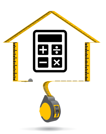
Our ventilation calculator is available online at Quarrix.com

Although Quarrix has been installed on over 6 million homes, a contractor unfamiliar with ridge ventilation may be apprehensive about installing it. Rest assured. Quarrix offers contractors free assistance in completing NFA calculations and determining where to place ventilation for optimal use, based on the size and shape of your roof and your area's weather conditions. "We're more than happy to help contractors," notes Quarrix Product Designer Scott Van Wey. "Most of the time we're simply double-checking house plans, ensuring everyone peace of mind that they're installing the most efficient and beautiful system."