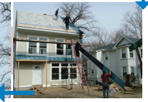
The metal roof panel are installed by a trained metal roofing contractor.