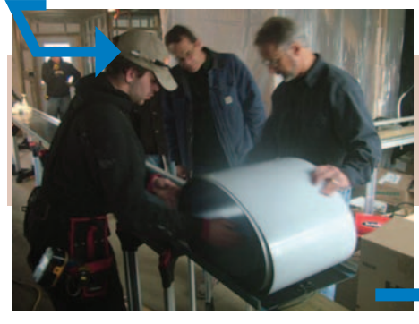
A trained metal roofing contractor installs the BIPV laminate directly onto a metal roof panel at the job site.