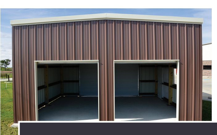
Framed Openings are available in a variety of sizes for each of your end walls.