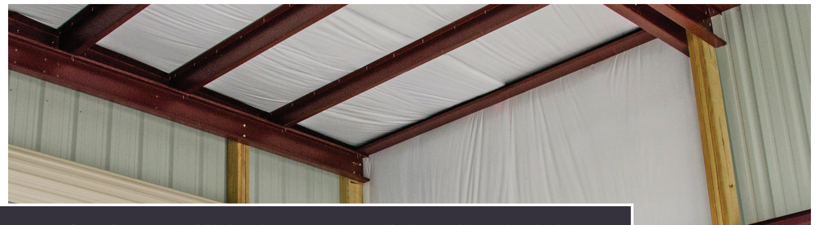
Depending on your individual needs, you can order your Handyman with or without insulation.