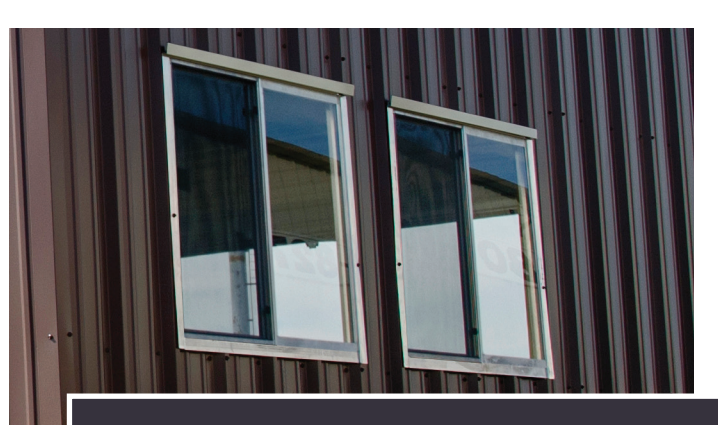
Install horizontal sliding windows to easily allow fresh air and natural light into your Handyman Building.